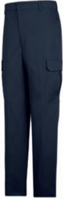
2360 (M) and 2362 (F)

HORACE SMALL 65/35 poly/cotton twill EMS pant Dark Navy only $26.25